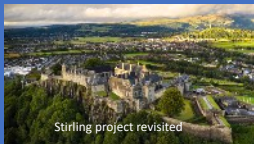
Stirling project revisited

All talks are at 7:30 p.m. on Wednesday evenings in the Soutar Theatre at the AK Bell Library in Perth. More details at www.psns.org.uk