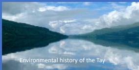
Environmental history of the Tay