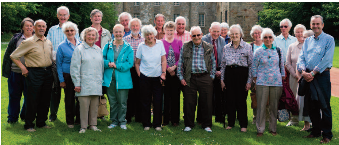
Some of our members enjoying themselves at the Society's Summer Outing

Kinneil House was the country house of the Hamilton family, situated midway between the twin centres of royal power in Edinburgh and Stirling. It is a 15th century tower house with a more modest 'palace' added in the 16th century, and which contains some of the most remarkable 16th and 17th century wall decorations in Scotland. Within its policies are a fortlet of the Antonine Wall, and the cottage built for James Watt to perfect the steam engine.