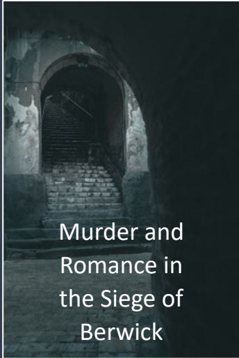
Murder and Romance in the Siege of Berwick