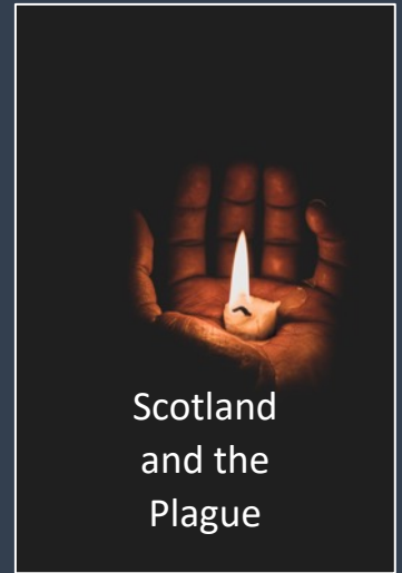
Scotland and the Plague