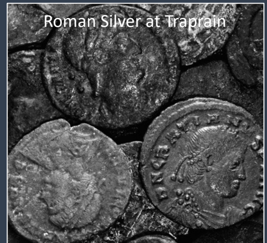
Roman Silver at Traprain

The A&H Section of PSNS has lined up a superb selection of talks for its Winter 21/22 season. All talks are at 7:30pm on Wednesday evenings. Due to the ongoing Covid situation all our talks this winter will take place on Zoom only. Non-members may obtain Zoom tickets by e-mailing psns019@gmail.com . More details can be found at www.psns.org.uk