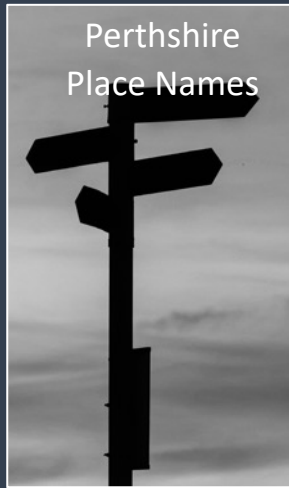
Perthshire Place Names