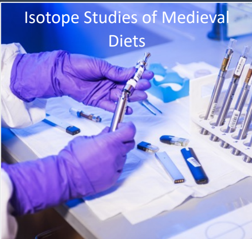
Isotope Studies of Medieval Diets