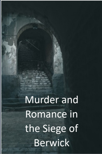
Murder and Romance in the Siege of Berwick